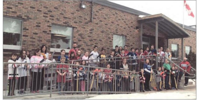
St. Martin of Tours students posted this photo on Twitter with the caption, "From small town Ontario to small town Saskatchewan. We're wearing our jerseys and keeping our sticks out for you #humboldtstrong. Keeping you in our prayers and sending love and light your way."